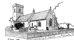
St Britius Church